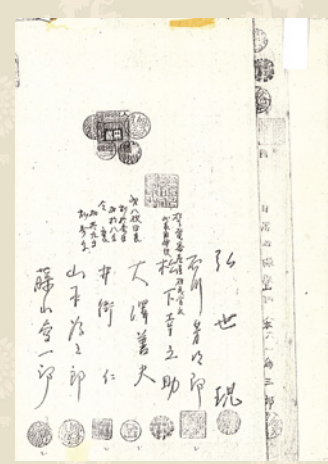
Signature portion of ULVAC's official incorporation papers, where it was registered as "Japan Vacuum Engineering Company"

ambition to "contribute to Japanese industry through a vacuum company," and promised full-scale backing. He went on to garner the strong support of six leading industrialists.