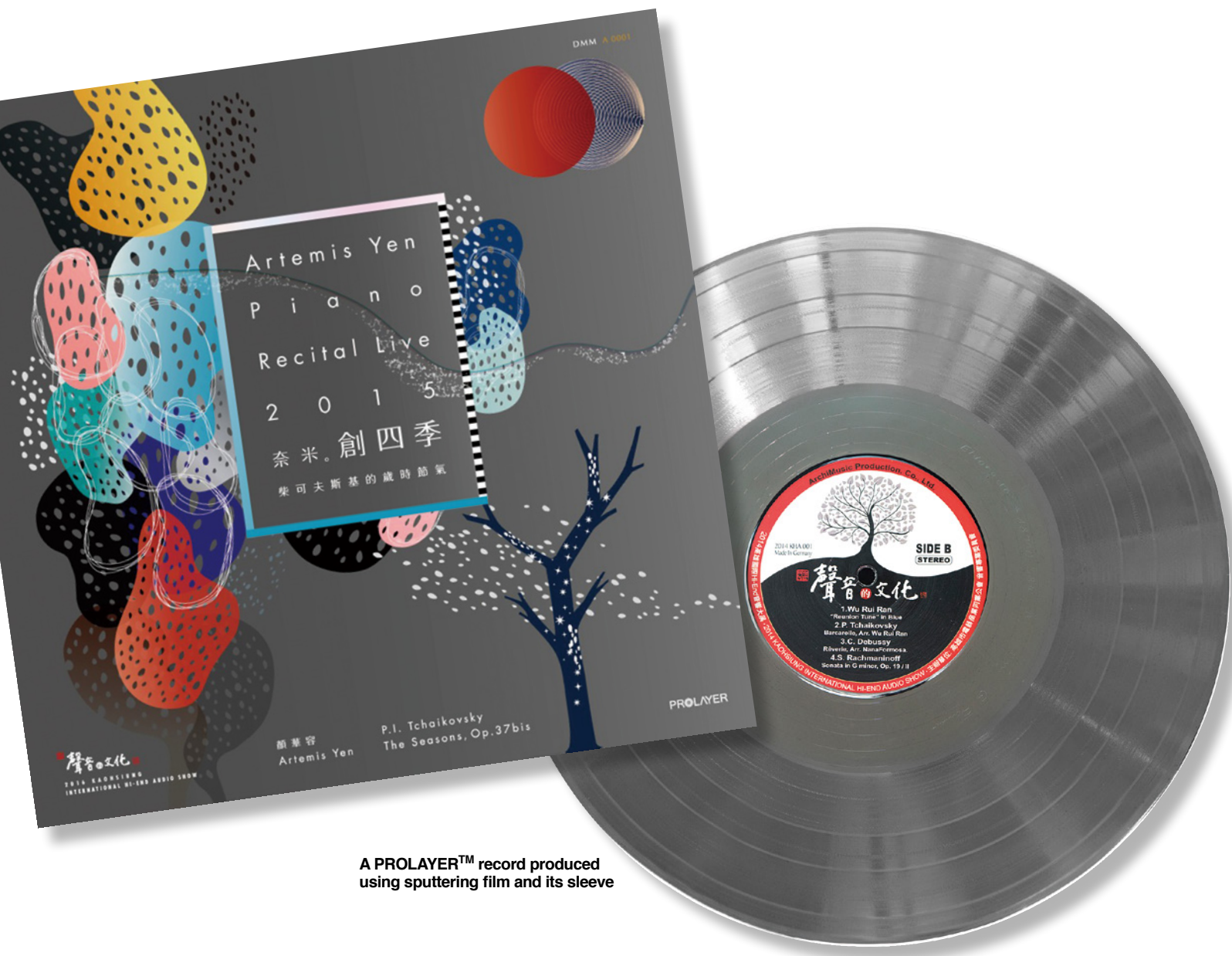
A PROLAYER™ record produced using sputtering film and its sleeve