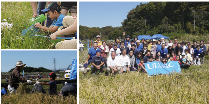
"Tanbo (rice field) project" will pass it's 5th anniversary this year

treatment, and culture in which a microbe gets involved to execute research and development with not only the reduction of cost, time and labor but also obtaining many knowledge.