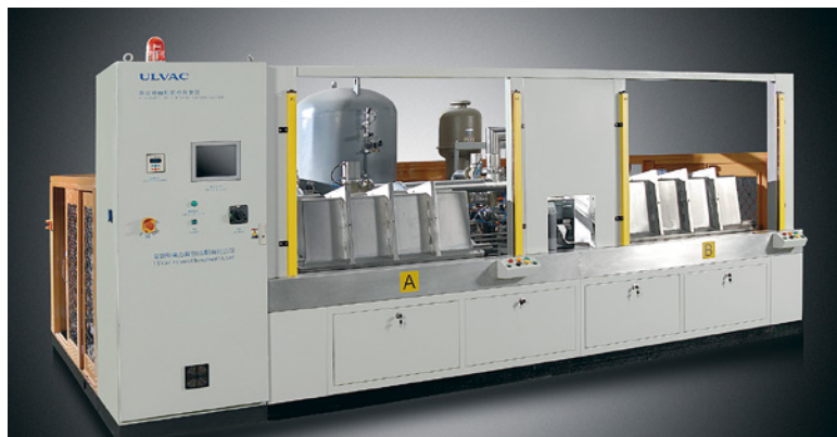
Automatic helium leak tester, “QYH-3000”

ULVAC, Inc. TEL: +81-467-89-2033 URL: http://www.ulvac.co.jp/eng/