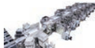
OLED production equipment