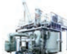
Vacuum melting furnace

With a long history of producing vacuum equipment for industrial use, ULVAC has been involved in this business sector since the emergence of vacuum technology in the 1950s. Leveraging the fundamental technology it has developed so far, ULVAC currently provides various solutions across wide-ranging industries, including the automotive, pharmaceutical, and food industries.