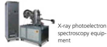
X-ray photoelectron spectroscopy equipment