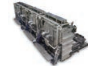
LCD production equipment

As befits a company involved in a range of FPD and PV manufacturing technologies, ULVAC not only develops production equipment but also offers solutions worldwide that leverage its development of advanced materials.