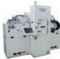
Sputtering equipment for electronic devices

Higher integration and higher performance at lower cost are demanded for next-generation semiconductors and other high-performance devices. Based on its development of super-miniaturization technologies for such semiconductors and other electronic devices, ULVAC delivers a stream of new technologies and products to the world that underpin the progress of society.