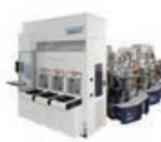
Sputtering equipment for semiconductors