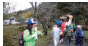
Volunteer staff at the 14th Yamagano Walking Event

In March 2015, the ULVAC Group, and ULVAC KYUSHU CORPORATION in particular, supplied volunteer staff to the 14th Yamagano Walking Event held in Yokogawa-cho, Kirishima-shi, Kagoshima Prefecture. They prepared the walking environment and erected tents and signs, we well as guiding participants and introducing historic features at important points on the day. 15 staff members participated, experiencing the remains of Yamagano Kinzan by touring historic features and explaining these features to participants.