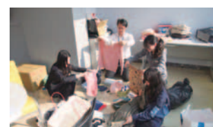
Donation to the Corning Education Center (Taiwan) and certificate of appreciation

In March 2015, ULVAC TAIWAN Inc. donated a total of 8 boxes of employees' clothing to the elderly as well as people on low incomes and people with disabilities through Corning Education Center, which supports independent living, receiving a certificate of appreciation.