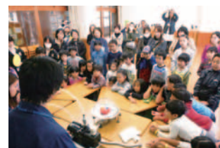
Vacuum demonstrations at local events