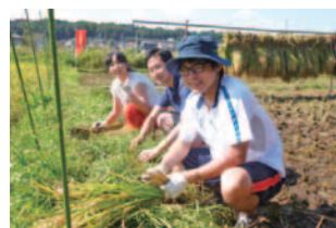
Tanbo (Rice Field) Project