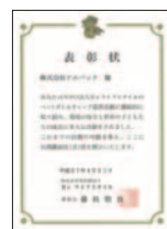
Award received from the incorporated NPO, Re Lifestyle in recognition of our continued activities.

ULVAC, Inc. has been collecting PET bottle caps since 2007. These are then used to provide vaccines for the children of the world through the incorporated NPO, Japan Committee, Vaccines for the World's Children (JCV). To this point, we have collected 2,173 kg of bottle caps in total, which is enough to provide polio vaccine to 1,738 people.