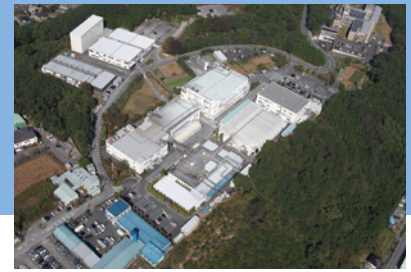
ULVAC COATING CORPORATION FINE SURFACE TECHNOLOGY CO., LTD.

Subsidiaries: FINE SURFACE TECHNOLOGY CO., LTD. (Chichibu, Saitama), ULCOAT TAIWAN, Inc. (Taiwan), ULVAC Coating Technology (HEFEI) Co., Ltd. (China)