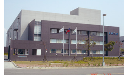
ULCOAT TAIWAN, Inc.