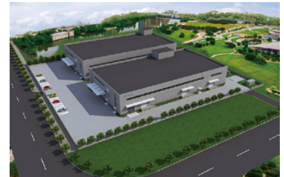
ULVAC Coating Technology (HEFEI) Co., Ltd. (Architectural illustration)