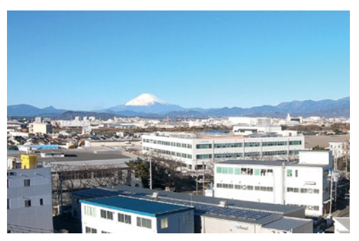
Mt Fuji and ULVAC TECHNO, Ltd. buildings are visible from the ULVAC Head Office.