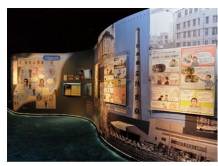
The "History River" corner, located on the 5th floor of the Head Office/Plant building, shows ULVAC's history.

At the Head Office/Plant, we primarily manufacture and conduct R&D on vacuum equipment and components for displays and semiconductors, as well as for medical/pharmaceutical applications and general industries. Because we deal with extremely large equipment, each work site is two stories high, and some work sites are clean rooms.