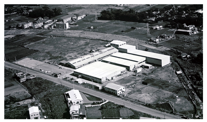
The Head Office/Plant relocated to Chigasaki City in 1968. Back then, the area was mostly rural, except for a few small factories, and regular bus service was not available.