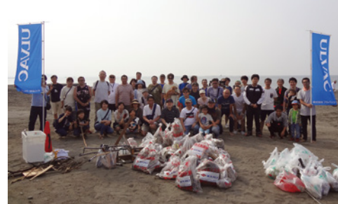
▲ Beach cleanup with a view of Eboshi Rock | 15

Twice a year, ULVAC, together with other local companies and community organizations, participates in clean-up activities at Chigasaki's Southern Beach. The activities help ensure that people using the beach will have a pleasant experience.