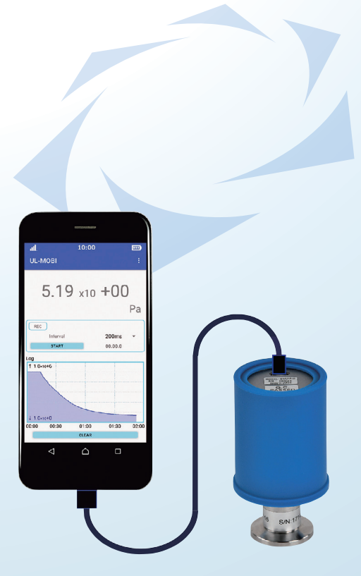
Image of product usage Note) Smartphone and USB cable are not attached.