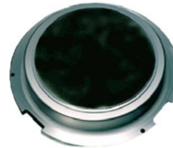
ULVAC Materials, Inc.