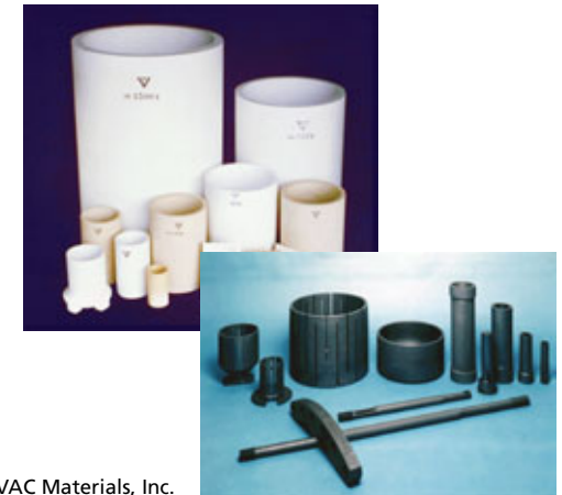
ULVAC Materials, Inc.

Heater, tray, and jig for vacuum heating treatment available