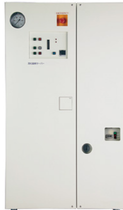
Liquid nitrogen server

●Contact Information ULVAC CRYOGENICS INCORPORATED TEL:+81-467-85-0303 URL: http://www.ulvac-cryo.com/english/